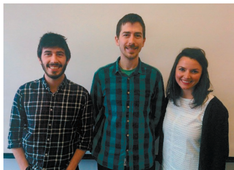
Elected Board at the local assembly on 19 April 2016

Our main goal is to increase the number of participants in our constituency by organizing more social events in other cities of the region. Among those, we are planning a visit to Birmingham's Botanical Garden in July, a Welcome Meeting in Birmingham and events in Nottingham and Coventry for the next fall.